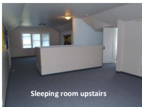
Sleeping room upstairs