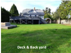
Deck & Back yard